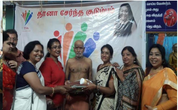
TSK NGO Volunteers