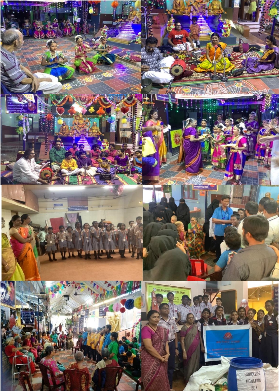
* Vels vidyashram school, Pallavaram during Nov 2019