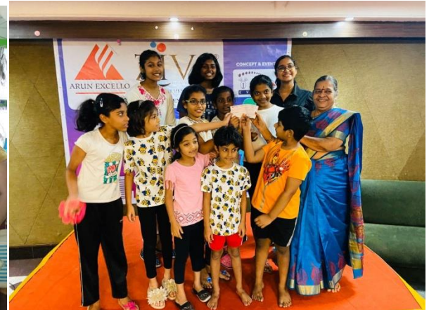
RMTIANS – Apartment association members