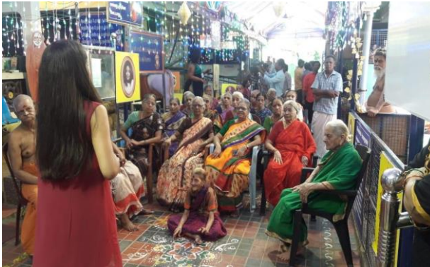
Sun Network team