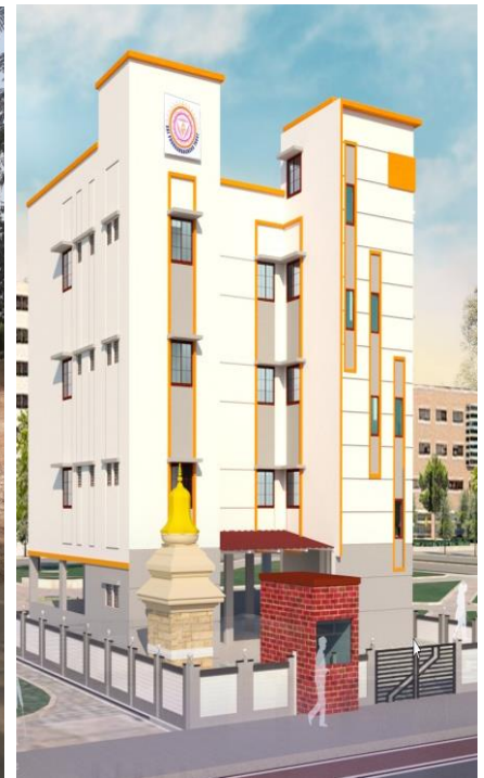
New proposed building