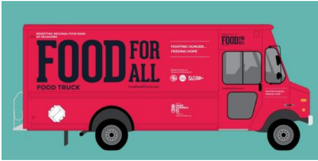
A model of the mobile food van proposed