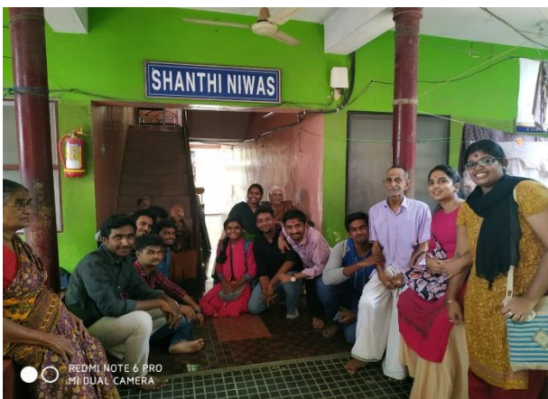
Bhumi NGO Volunteers